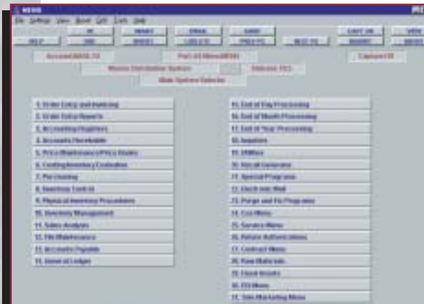
MDS' Main Menu

RemoteNet B2B E-Commerce and Web Based Customer Information System